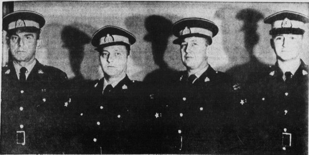
Several Important changes in staff positions involving promotions for four members were announced by "L" Division headquarters...