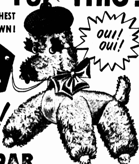
Approximately 20" overall, this woolly French poodle has big, shiny eyes, satin collar—ribbon with bow, cocky plaid cap—You'll adore it for counterpin decoration! Assorted colors.