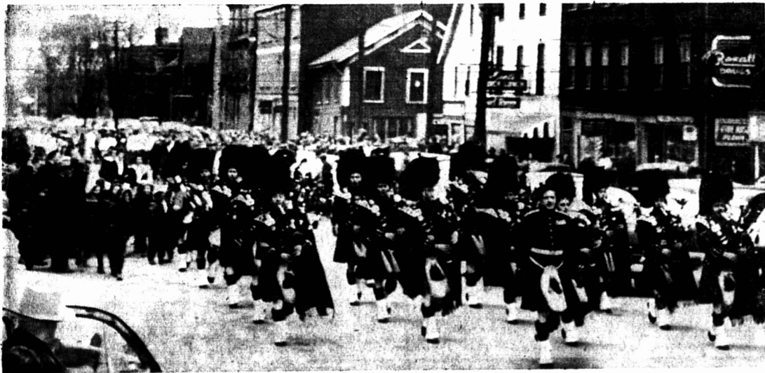
The 22 piece Black Watch Pipe Band from Aldershot, business section of Charlottetown yesterday afternoon. appearances in the city while on their one-day stay here. Curling Club rink before the 7 p.m. draw last evening, but it is hoped that they will make another appearance Nova Scotia, leads the curlers' parade through the main. This colorful and skillful group of musicians made four. They piped the curlers around the ice at the Charlottetown. They leave this morning by air, returning to their base, here during the summer months.