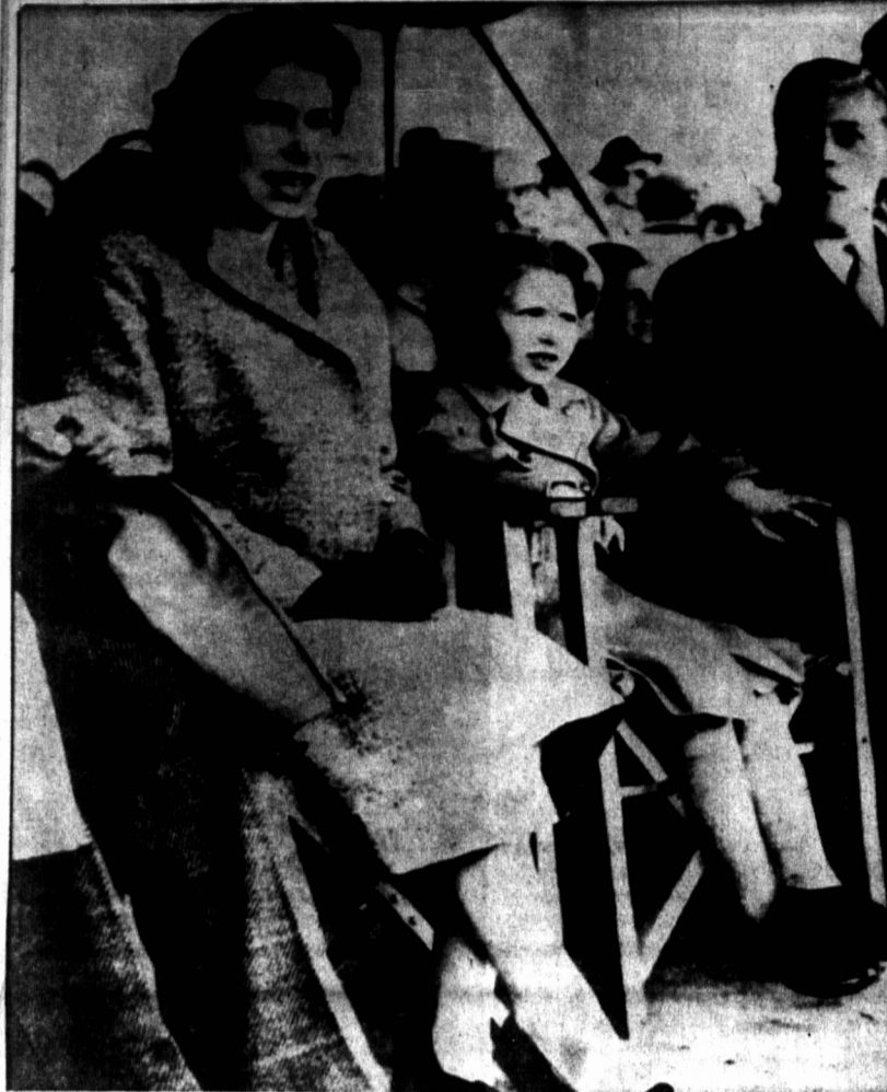
QUEEN AND PRINCESS AT HORSE SHOW

Queen Elizabeth and her daughter, Princess Anne, sit in the Royal Box to watch the jumping on the last day of the Royal Windsor Horse Show at Windsor, Berkshire, May 11. Man at right is unidentified.