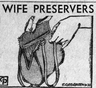
Don't toss out an old handbag without examining it. A new frame can often be found at the notions counter, if that's the part that is damaged. If the covering is the part that is worn and the frame is still intact, its restoration is simple.

"Perhaps my biggest asset is that I have a strong stomach," Miss MacKenzie said. "I can take a grind. I had the best training in the world for it during four years of appearing every week on Your Hit Parade. Nothing can take the place of that." As do many women, Miss MacKenzie finds her greatest relaxation in shopping. "It doesn't have to be Christmas," she said. "Every Monday I take the time off to go shopping. For what? Anything. I don't care what it is. I just like to get out and rush from store to store." Point d'Alencon lace is a noted product of the old town of Alencon in France.