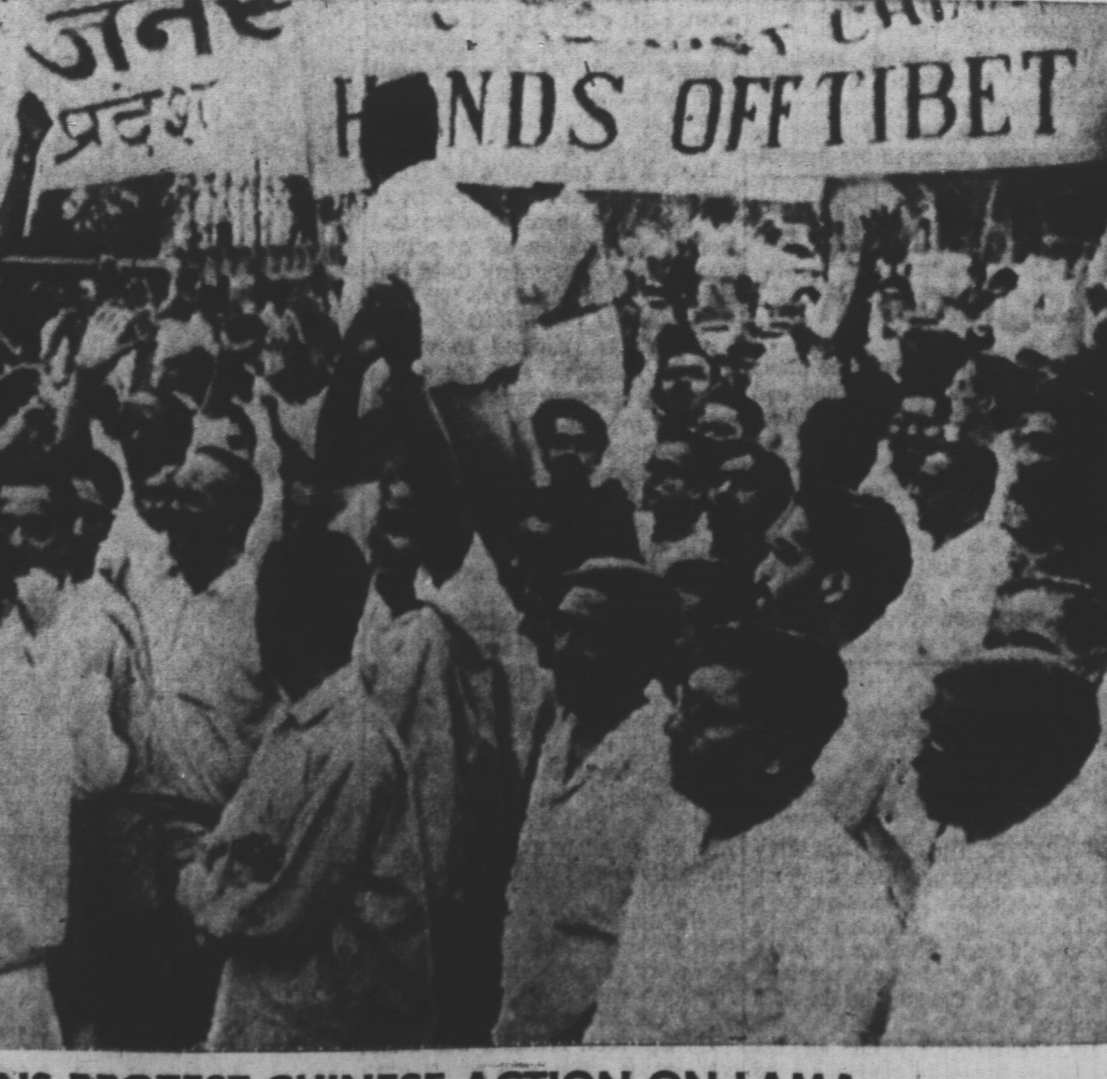
INDIANS PROTEST CHINESE ACTION ON LAMA

Indian demonstrators carry banners protesting Red China's action in Tibet during demon-