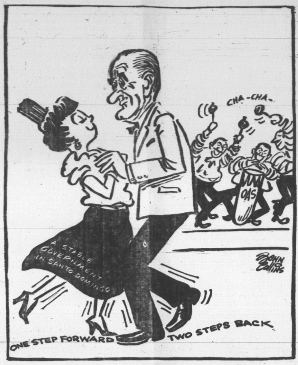
THOSE LATIN AMERICAN DANCES

Four million dollars have so far been spent this year on the malaria eradication program in West Pakistan. The entire program is scheduled to be completed by the end of 1965 at a total expenditure of $70 million.