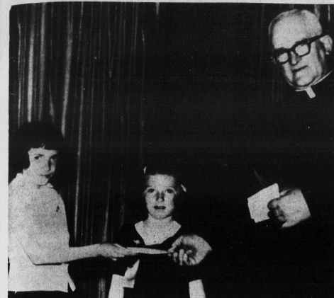
PRESENTS FESTIVAL PRIZES

Lawn Mower Repairs Dial 4-4223 KEITH GARMICHAEL LTD. Brackley Pl. Rd., Sherwood