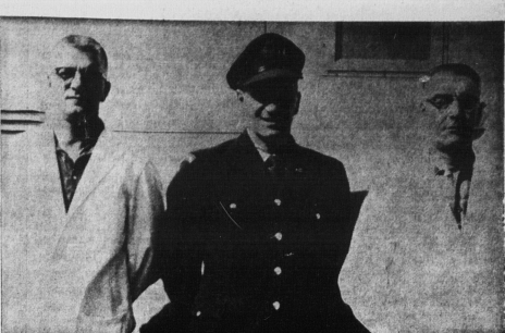
MOBILE LAB VISITS MONTAGUE