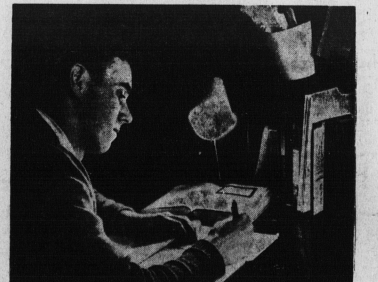
Yes, he is the 'busiest little businessman' in Canada; school, picking up his papers, delivering, accounts, studying and homework. Next time you see your newspaperboy, take a minute and talk with him, learn a little about his plans for the future. You will be pleasantly surprised. Our future and yours could well rest on his shoulders.

we salute our carriers on National Newspaperboy Day Saturday, October 17th The Guardian