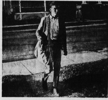
Most of us take our newspaperboy for granted. We see him delivering the paper and heading down the street. And yet, he is your main link with the entire world. From the bag over his shoulder he brings you all the latest world and local news, sports, comics. If, for some reason your paper is late or doesn't arrive at all, you realize just how important your newspaperboy is to you.