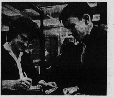
Accounts receivable, profits, etc., are all problems facing your newspaperboy. He keeps his own books, substitutes money from his profits to cover the few 'late paying customers' and then clears his account with the newspaper. He's a salesman, too! A lost customer represents lost profits and he must cope with newspaperboys from other papers: all in a day's work, six days a week.