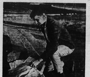
Before or after school, when most other students are batting a ball around or heading to the corner store for a bottle of pop, your newspaperboy is picking up his papers and preparing them for his route. In rain, heat or snow, six days a week, he follows the same pattern even during his summer holidays.