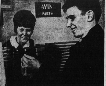
Your 'busiest little businessman' undoubtedly already has an interest in your community through his bank account. Large or small, he has a bearing on our economy. Multiply his account by the tens of thousands of other newspaperboys and you will have an astronomical figure. Naturally, he spends some profits on himself and, you will agree, it is justly deserved.