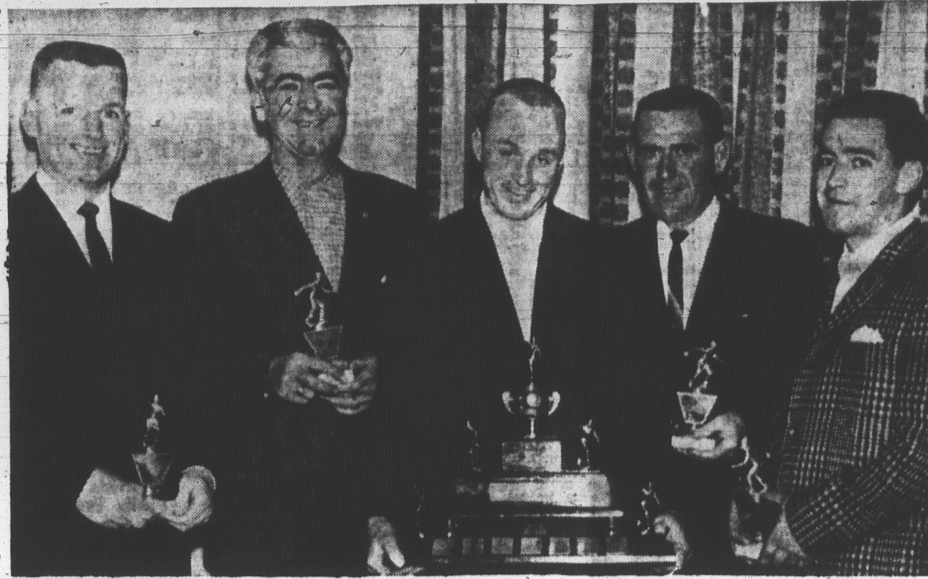
Pictured above are the winners of the MacLean Electric trophy given to the winning team in the Basilio Mens Bowling League.