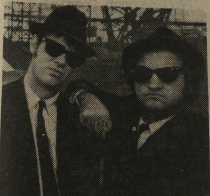
THE BLUES BROTHERS