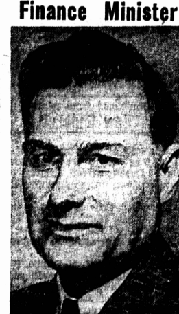
Hon. Walter Harris, former Minister of Immigration, who has been appointed to succeed Hon. Douglas Abbott as Finance Minister in the Federal Cabinet.

Large Barn At Scotchfort Destroyed During Storm; Dwelling Saved (Continued on page 6, col. 4)