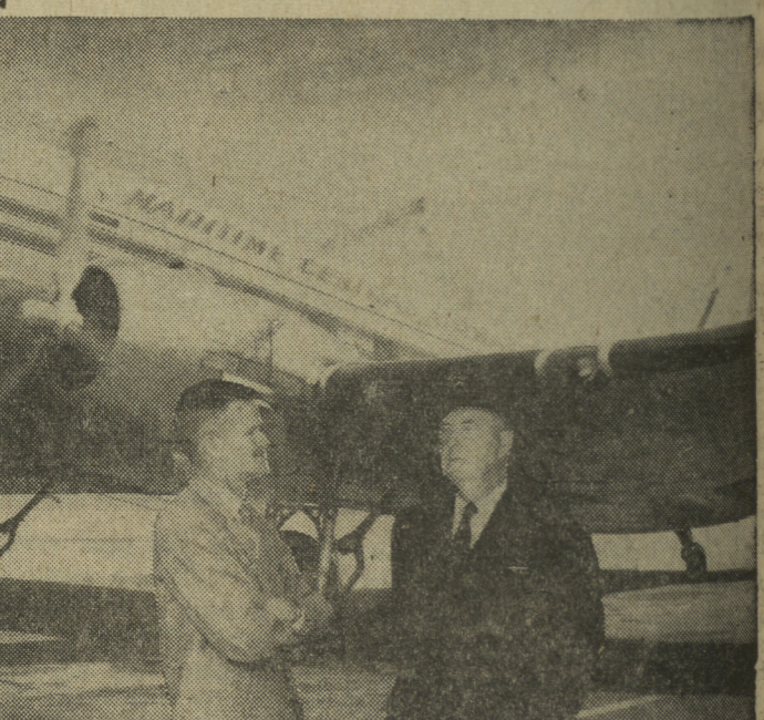
* President of Holman's Limited, P. E. Island's Largest Department Store.