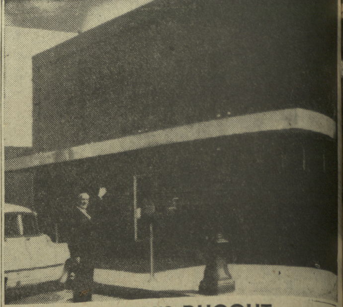
CASEY'S DUGOUT Yankee strategist, Casey Stengel, arrives for work at his Glendale, Calif., office — the Glendale National Bank, of which he is vice-president. Casey owns five per cent of stock. Others are Del Webb and Al Lopez.