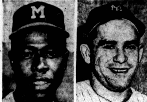
HANK AARON YOGI BERRA