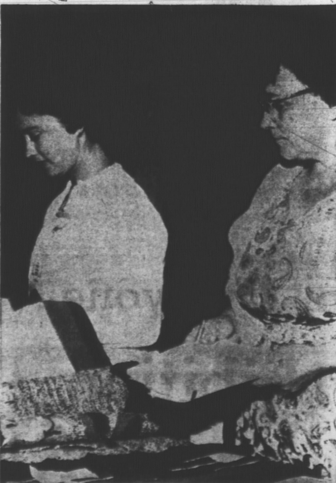
JUDGING RUG EXHIBITS