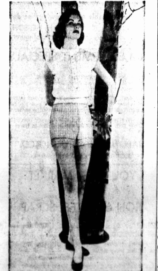
BRIEF PLAY OUTFIT

Very brief shorts teamed with the shorts fit beautifully. Worn with them is a cotton T-shirt with a tab front and tiny cap sleeves. Both shirt and shorts, which are a blend of combed cotton, celanese and acetate, are washable and need little or no ironing.