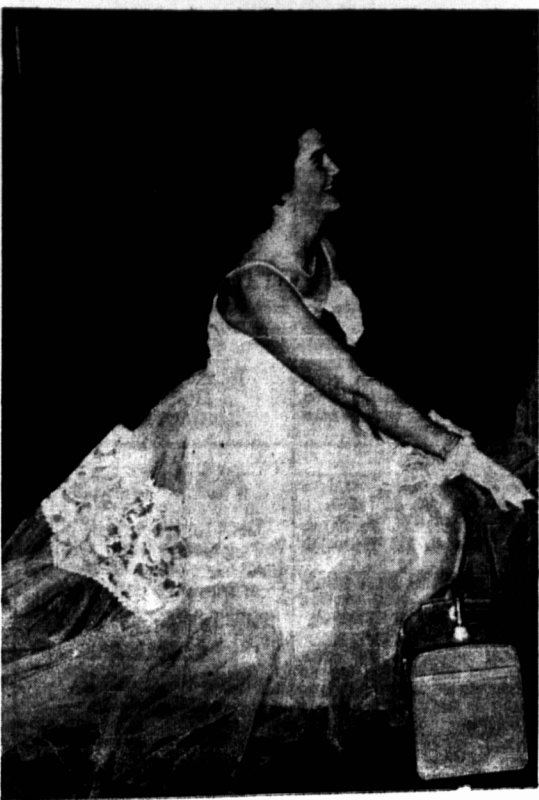
REPRESENTED P. E. I.