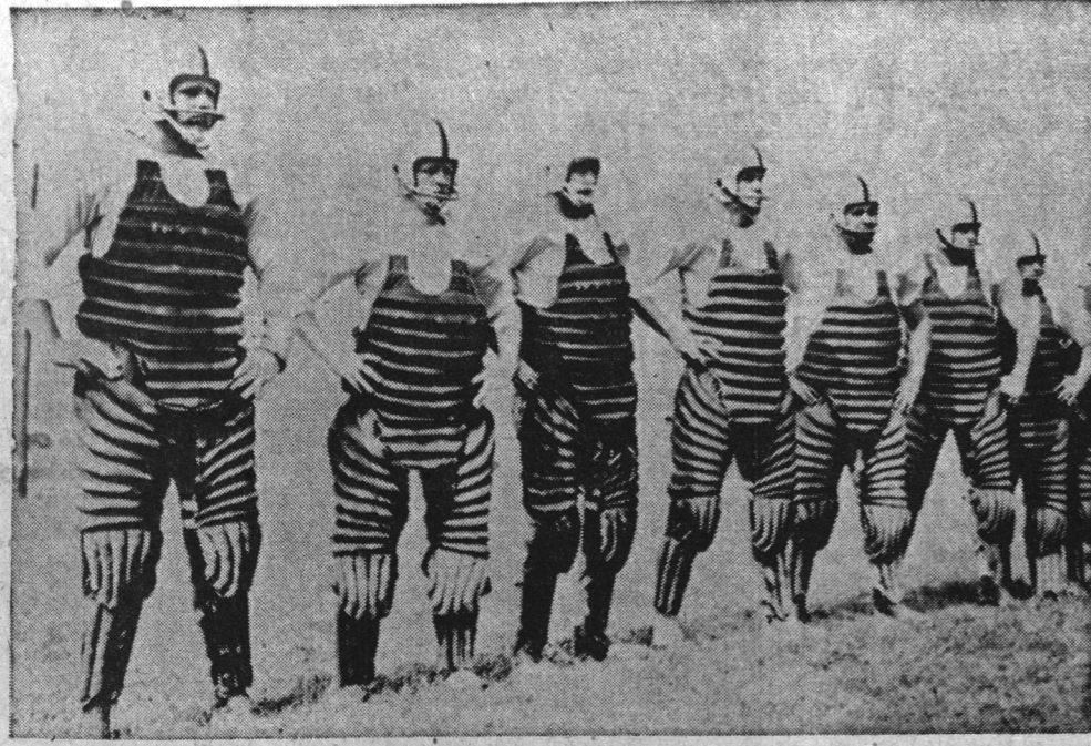
NO SPACE HERE