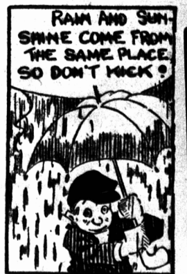
RAIN AND SUN SHINE COME FROM THE SAME PLACE. SO DON'T WICK!