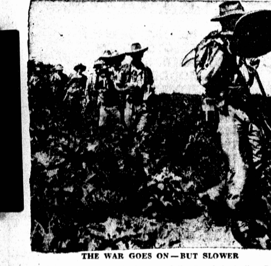
THE WAR GOES ON - BUT SLOWER Members of the assault pioneers of the Royal Australian Regiment are navigating some rough terrain in Korea. The man leading the patrol is carrying a mine detector for use in locating Communist booby traps. Cease-fire plans have slowed activity in most sections, but the Chinese have wasted no time digging solid fortifications.