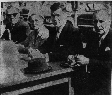
BAND, FLOAT JUDGES HAD RINGSIDE SEAT FOR THEIR HARD TASK