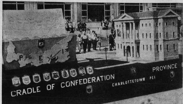
CROWDS LOUDLY CHEERED CITY'S AWARD WINNING 'CONFEDERATION' FLOAT