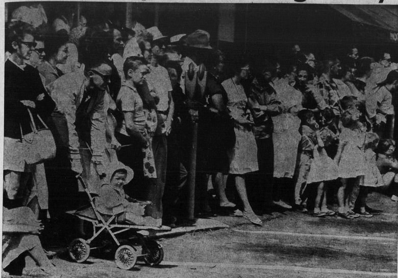
THIS IS A SMALL SECTION OF THE HUGE CROWD THAT THROUGED THE ENTIRE PARADE