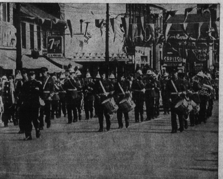
P.E.I. REGIMENT BAND TOOK TOP HONORS IN COMPETITION