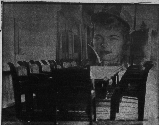
BIRD'S EYE VIEW OF MINIATURE CONFEDERATION CHAMBER ON CITY FLOAT