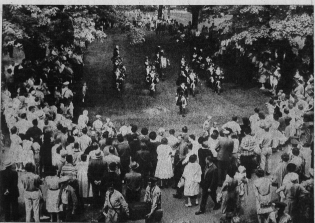
MACDOUGALL BAND FROM GLACE BAY WON PRIZE AND THRILLED CONCERT CROWD