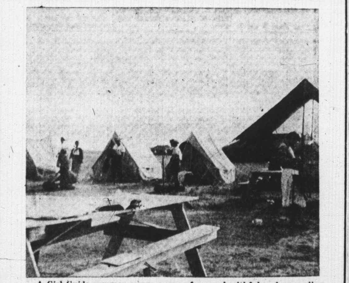
A Girl Guide summer camp — one of many healthful and rewarding Guide activities.