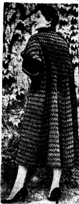
Round and round go the stripes in this new fashion coat of rust and silver-gray in a ribbed brushed wool fabric. It has an added "back-interest look" with high waist seaming and gently-flaring skirt. (CP PHOTO)