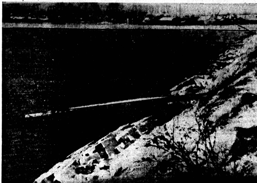
These pictures show the havoc wrought by the recent storm to the bridge, looking towards Charlottetown, as shown above. The lower picture, taken from the Charlottetown approach, shows the complete line of poles which were down.