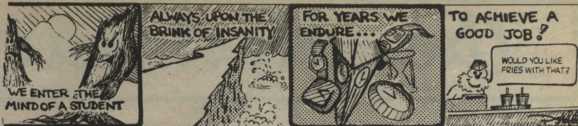
Vamp on Camp