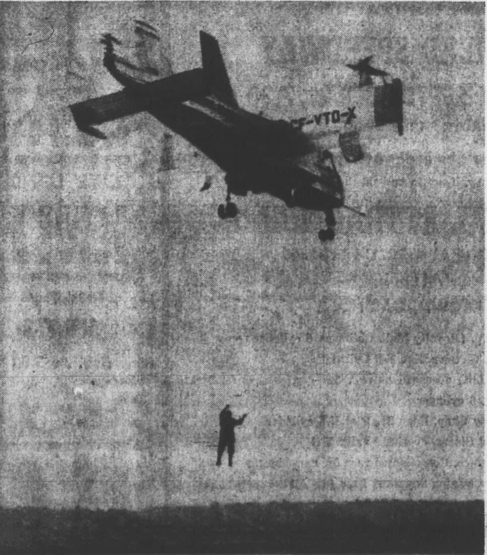
CANADA SCORES WORLD FIRST Canadair Ltd. said Monday it has scored an important world first with its tilt-wing CL-44 which can take off and land vertically, hover over one spot or fly horizontally at 320 miles an hour. The plane successfully lifted a man 40 feet from ground to cabin in one minute in a simulated rescue operation, said to be the first in history by a tilt-wing aircraft.

OTTAWA (CP) — A proposal that would set $4.50 a hundredweight as "a basic average price" for industrial milk was made to the federal government Monday by Ontario and Quebec.