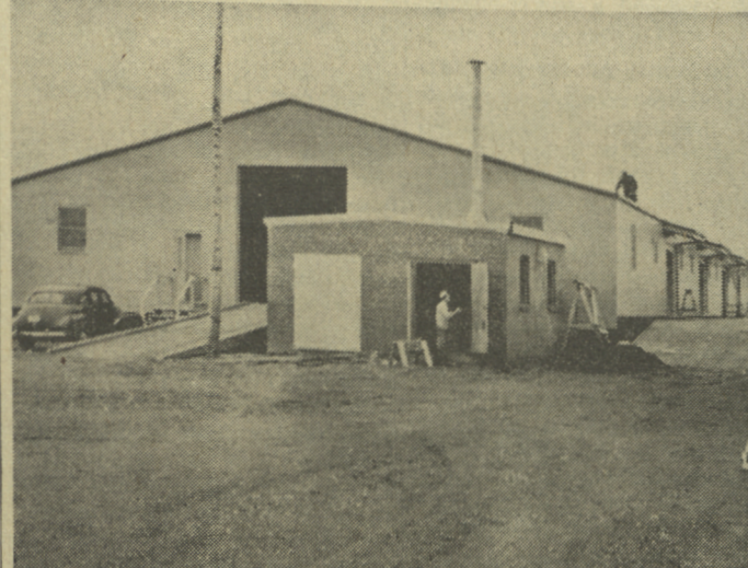
NEW GEORGETOWN WAREHOUSE