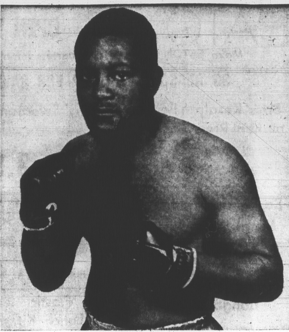
SPARKS TO FLY TONIGHT