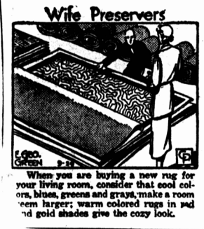
When you are buying a new rug for your living room, consider that cool colors, blues, greens and grays, make a room seem larger; warm colored rugs in red and gold shades give the cozy look.

Herman N. Bundesen, M. D. TWO great threats to the health and welfare of men and women alike are boredom and habit—that is, bad habits. Good habits are, of course, conducive to health, welfare and happiness. Boredom may lead to overeating, or even to pursuit of dangerous pastimes. I mention habit particularly because it is closely related to a most common form of minor ailment, namely, bowel sluggishness or constipation. Children trained in proper bowel habits rarely grow into adults who suffer from constipation, and these are easy habits to teach. If adults have good habits in this regard, the children are likely to have them also, for good habits are more easily caught than taught by daily example. On the other hand it takes a balance between insistence and overlooking a failure to attain the desired goal. Too much insistence on the importance of bowel habit in the child may lead to the development of a spirit of resistance on his