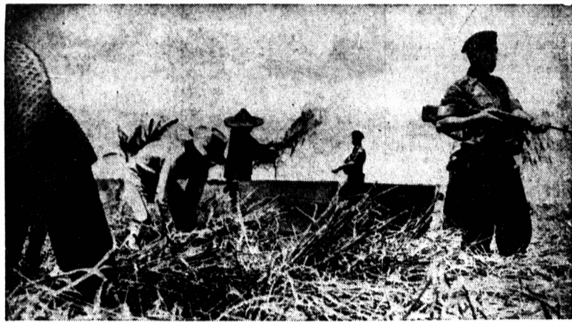
Alert armed Gurka soldiers guard native Malavans as they harvest their crops in the Kuala Selangor rice bowl area. The troops are necessary because Communist terrorists constantly attempt to harass the efforts of the natives.