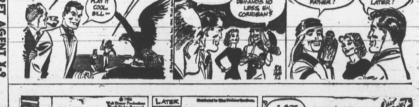
SECRET AGENT X-9