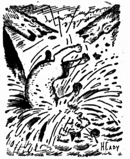
Without warning, the tree broke, and Yowler landed in the water with a great splash.

A little way farther on above where that dead fish lay at the edge of the water a dead tree had fallen across the brook. It was rather small, but Yowler could walk it. It would make a bridge