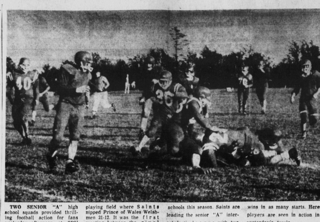
Two senior "A" high school squads provided thrilling football action for fans yesterday afternoon at SDU.

NEW YORK (AP)—Ford Frick, commissioner of baseball has called a meeting of all major league club owners in St. Louis for next Monday "for the purpose of studying the entire minor league structure." Frick said Wednesday that the owners would set up working agreements for the 1964 season with a view toward directing toward the triple AAA level, the International and Pacific Coast. Each now has 10 members. Some realignment to cut down travel costs will be sought. A Frick spokesman, however, said that the American Association had been dropped.