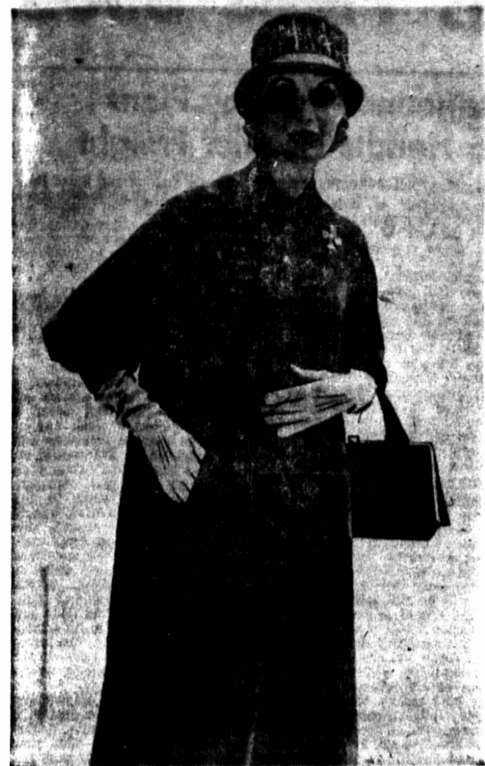
BRIGHT RED TOPPER

From California comes the design of this graceful, swirling coat made of jersey in one of the new "hot" reds. And it is the perfect coat to see you right through the winter and on into spring. The topper has slim shoulders, a throat buttoned high with a single self-button, and the sleeves bell out above the elbows. They are push-up styled and come to below the elbow for popular fashion length and are pictured with the longer gloves.