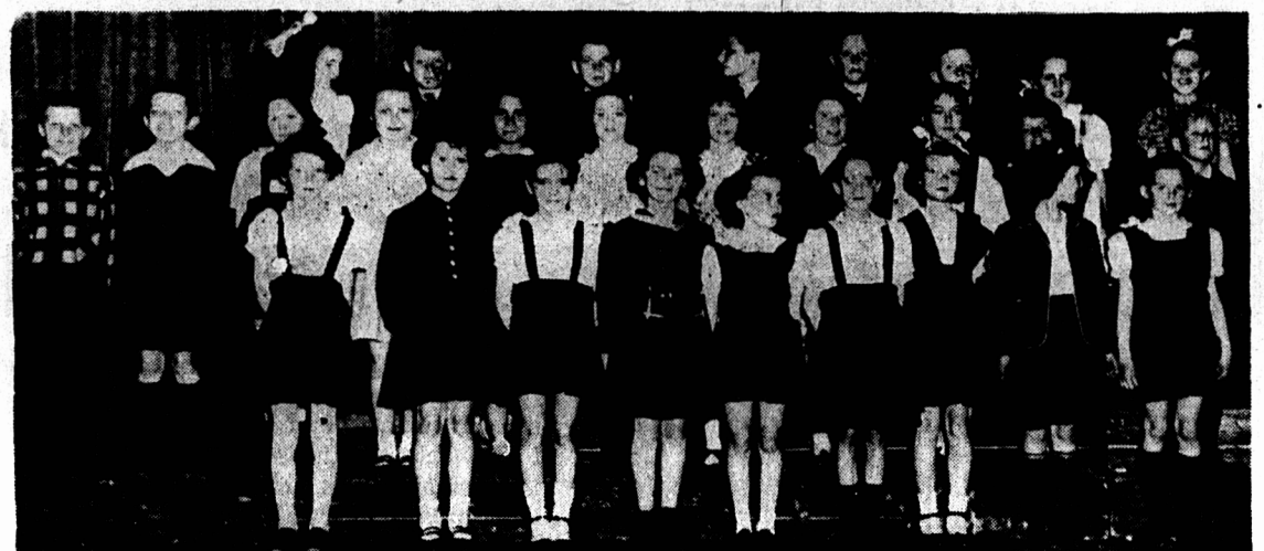
Shown above is the Summerside School Chorus, comprised of pupils from grades 3 and 4, who won class 57 of the recent Festival of Music. Summerside received 83 points, the highest of the three entries.