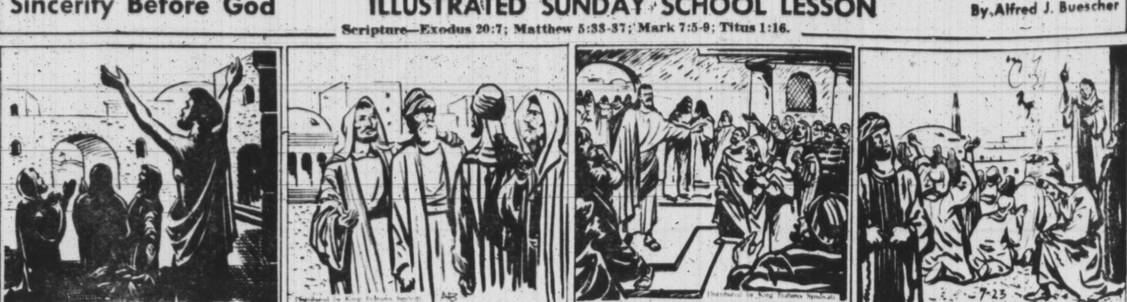
God has declared His name to be sacred, holy, and to be revered above all others. Profaning it is a sin against the Holy Spirit. — Matthew 12:31-32. Simple, sincere, truthful speech would make oaths unnecessary. What men say should reflect what is in their hearts. — Matthew 5:33-37. Jesus condemns those overly concerned with external symbols, acts and rituals, but not in their hearts. — Mark 7:5-9. Men's hearts are all important. If we profess belief in God, we must reverence His name. — Mark 7:6-7. GOLDEN TEXT: Luke 6:45.

MEMORY VERSE: "And why call ye me, Lord, Lord, and do not the things which I say." — Luke 6:45.