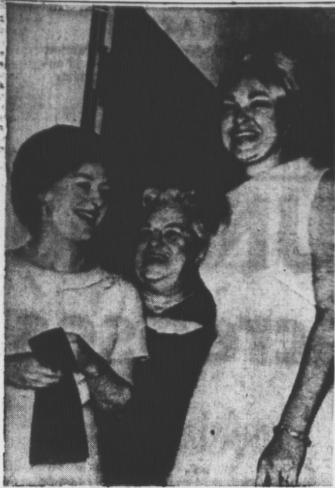
MEG TAKES TEA