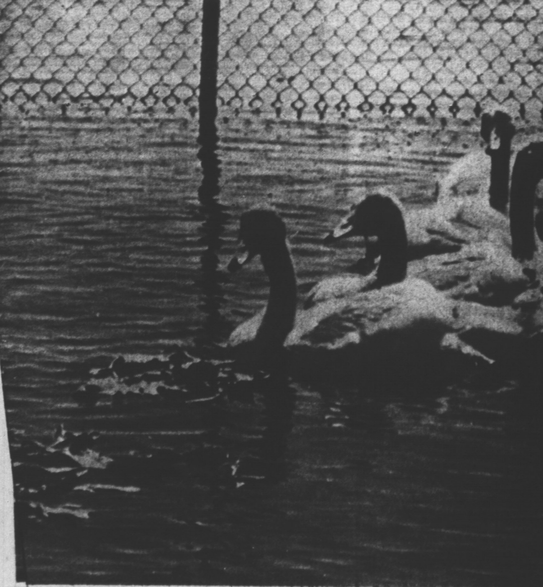
RUMPETER SWANS SURVIVE Five young Cygnets of the Rumpeter Swan Species — Delta Waterfowl Station near Portage La Prairie, Manitoba. The five hatched about six weeks ago, are believed the first hatched in captivity in North America for 50 years. The four shown are being reared by humans and another is being cared for by its parents.