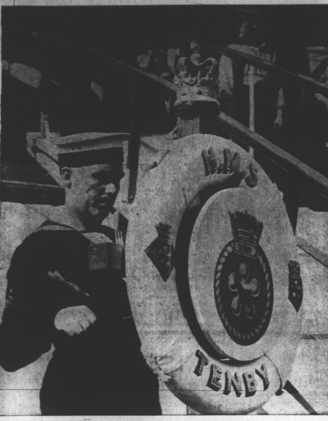
NAVAL SHIPS SAIL TODAY

This attractive crest of the H.M.S. Tenby, which for the past three days served its purpose in identifying one of two visiting British Navy frigates, will be removed today as the ships leave the Charlottetown port and head for Montreal where they will be joined by two other frigates. The four vessels will then continue on to the Canadian National Exhibition at Toronto. Yesterday afternoon a large number of citizens took advantage of the Royal Navy's offer to inspect the two large and modern frigates.