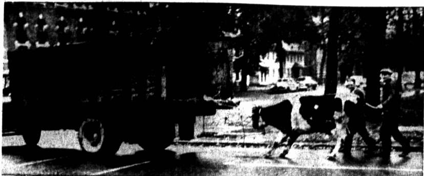
SHORT LIVED FREEDOM

Featuring horizontal-sweep styling, the 1957 Chevrolet looks even longer than its 200 inches—two and one-half inches more than last year. All bodies are lower too and further additions have been made to windshield area, the whole adding up to striking eye appeal. Among the many mechanical advancements is revolutionary fuel-injection as an available option. Shown above is the Bel Air sport coupe.