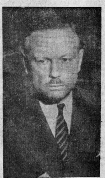
HON. MR. FLEMING

OTTAWA (CP)—Finance Minister Fleming indicated Friday he will restrict his dealings with Premier Matheson until the Prince Edward Island premier withdraws statements he imputed to two federal civil servants.