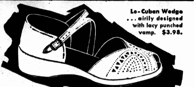
Lo-Cuban Wedge . . . airily designed with lacy punched vamp. $3.98.