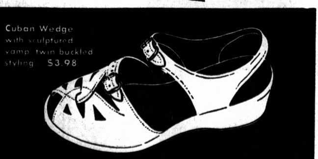
Cuban Wedge with sculptured vamp, twin buckled styling. $3.98

At your Agnew-Surpass Shoe Store is Canada's widest selection of summer shoes. Be choosy, for you'll find a choice of shoes unmatched for variety, unexcelled for economy, and fitted with expert attention. Many styles, many colours, many shades and all sizes are yours at Agnew-Surpass . . . a visit will prove that here is a world of summer shoe fashions at your feet.