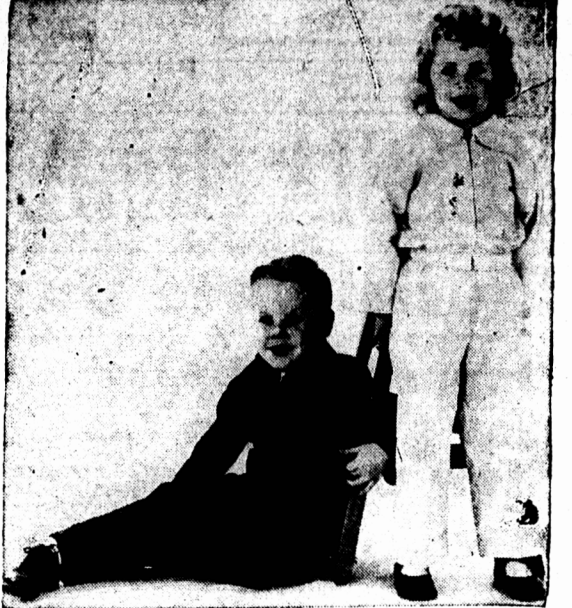
Pinwale corduroy in brother's sister Jodpur sets with zipper pop-over jackets from Gay Togs are as handsome as they are practical. Brother wears royal blue and sister chooses yellow.