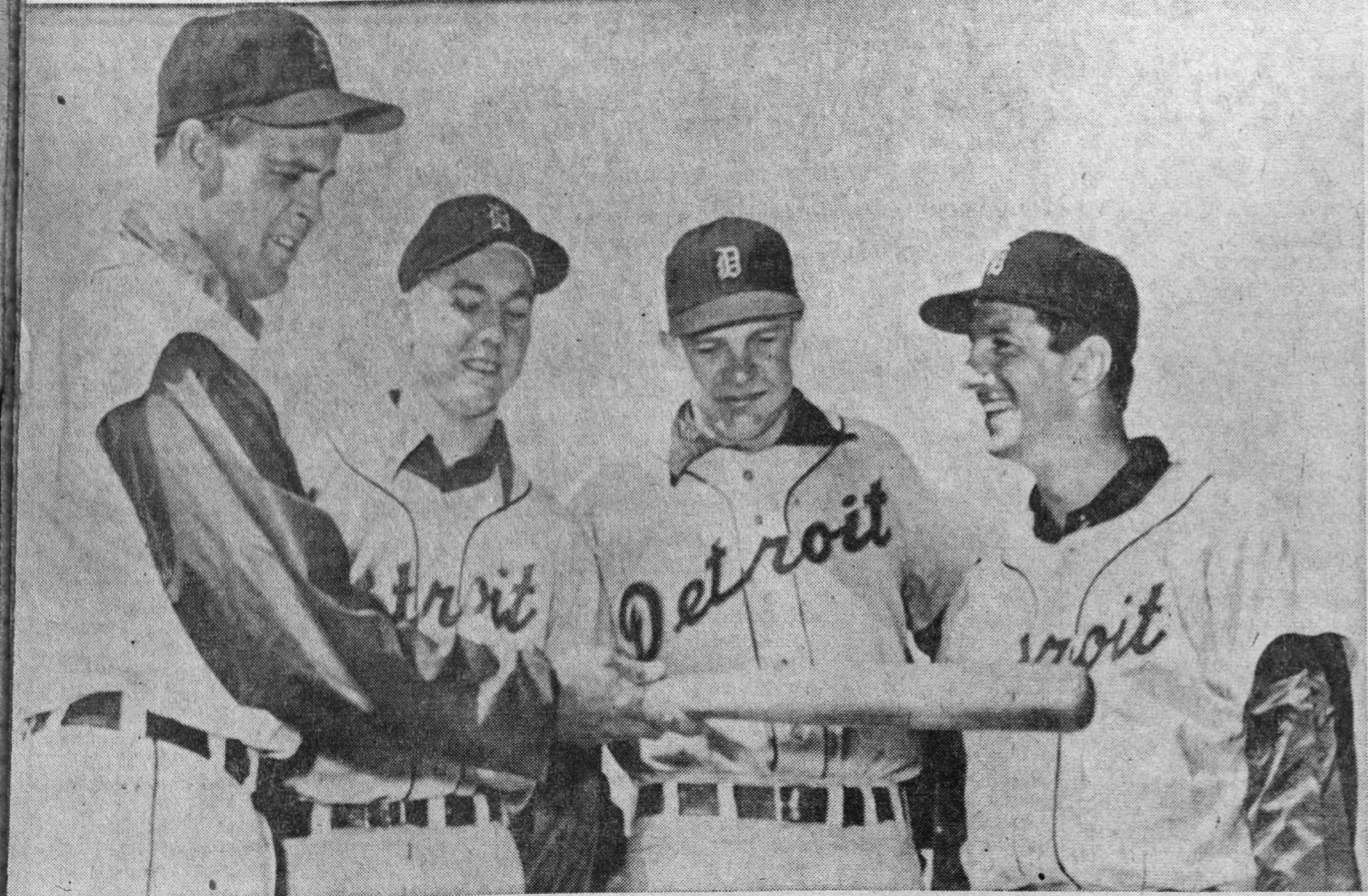
REGULAR GUYS GET TOGETHER

Former New York Yankee fielder Billy Martin, wearing Detroit uniform for the first time, gathers with new team-