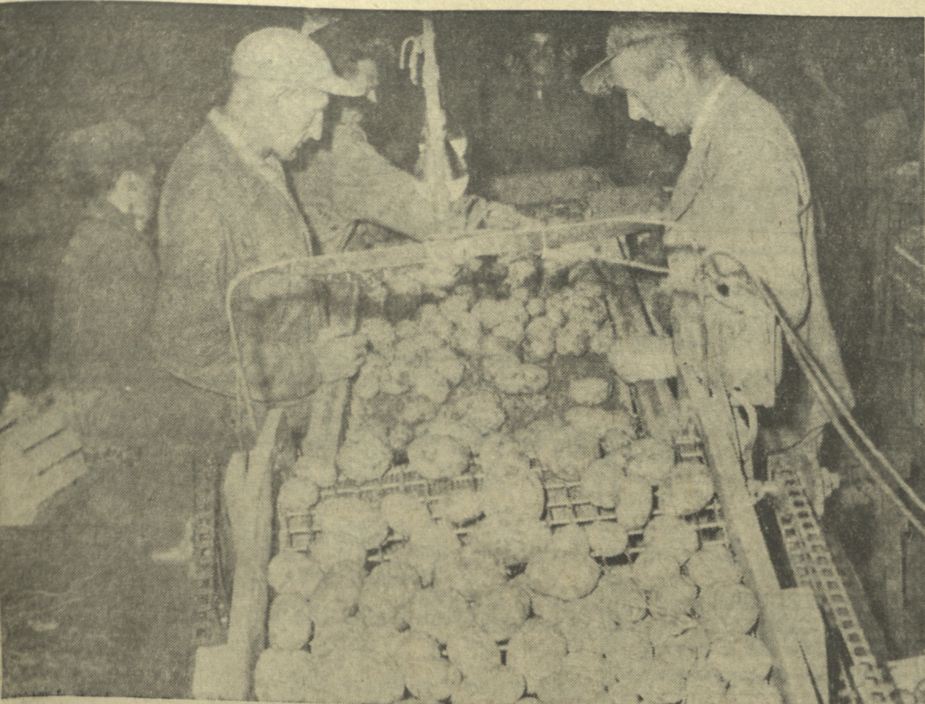
DECISIONS, DECISIONS, DECISIONS IN GRADING