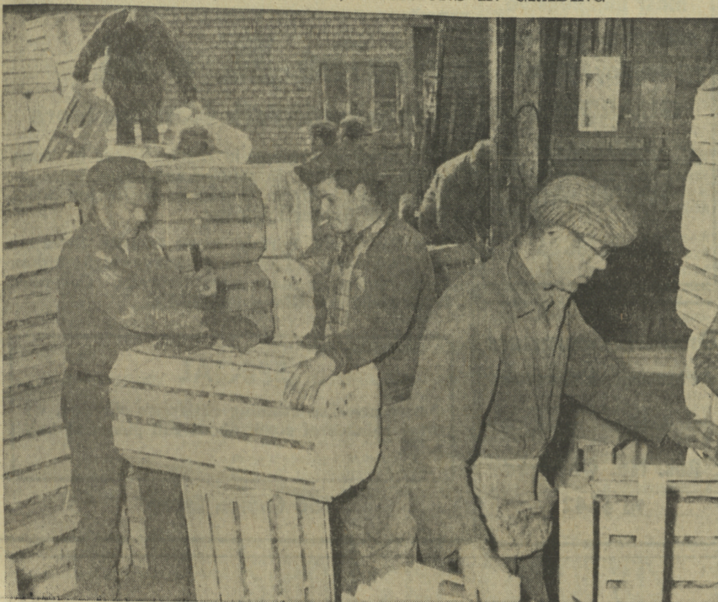
THESE CRATES GIVE PROTECTION