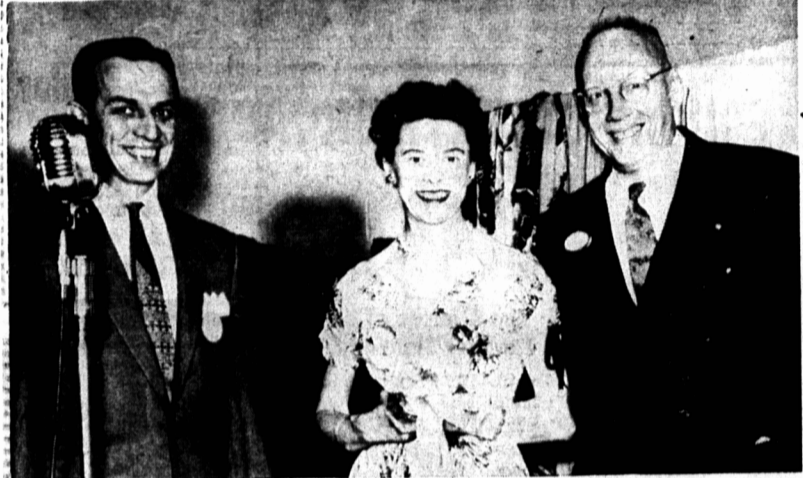
GORDON report revue principals on stage at the Charlotte Hotel Rotary Ladies' Night.