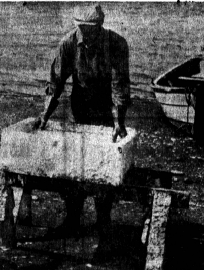
An Ellerslie, P. E. I., oyster farmer makes a "spat" colony by dipping cardboard egg trays in concrete. Collectors with a spat oyster spat (larvae) with a clean firm bottom on which to settle and develop.