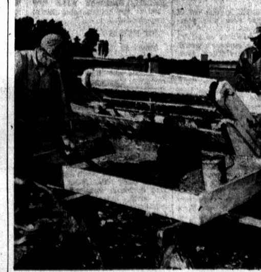
At Fisheries Research Board biological station at Ellerslie, spat is collected from concrete egg crates fed through threshing machine. Work of 20th century biologists has done much to improve oyster harvest, and to improve quality of the humble bivalve.