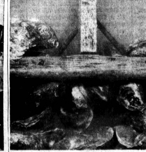
Despite hard protective shell, oyster is prey to sea enemies like mussel, drill and starfish, and is subject to disease in germ-ridden waters.