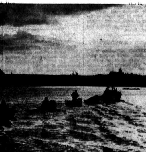
To preserve mussel and starfish, the Fisheries Research Board is bringing science to the oyster industry.