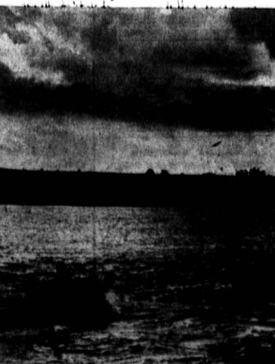
Fishermen working public grounds generally concentrate on beds fair to close to shore, leaving large beds in center of bay to big commercial companies.