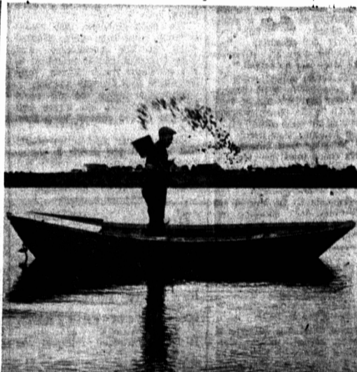
Fall planting of oysters on privately-leased beds will bring dollar harvest to this Maritum oyster man in 5 to 8 years when mollusks reach marketable size.