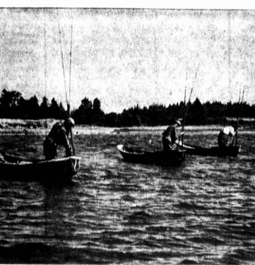
Using scissors-like tongs, twenty-foot long, these Malpeque Bay oyster fishermen are shown harvesting part of Canada's annual million dollar oyster crop.