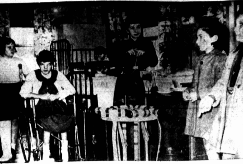
BROWNIES VISIT POLIO CENTRE Brownies of the 1st and 3rd Charlottetown (St. Paul's and St. James) pack visited the children they had put on a Gipsy Tea.