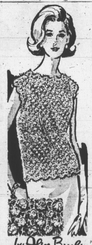
by Alice Brooks IT'S JIFFY - KNIT

Delight Dad with your thirty, good sense — enchant daughter with this pretty flare of a coat. Few pattern parts, simple lines make it simple to sew. Printed Pattern 4545: Children's Sizes 2, 4, 6, 8, 10. Size 6 takes 2 1/2 yards 35-inch nap. FIFTY CENTS (50 cents) in coins (no stamps, please) for this pattern. Ontario residents add 2 cents sales tax. Print plainly SIZE, NAME, ADDRESS, STYLE NUMBER. Send order to ANNE ADAMS, care of Guardian-Patriot Needlecraft Dept., 60 Front St. W., Toronto 1, Ont. COMPLETE FASHION REPORT in our new Spring - Summer Pattern Catalog plus coupon for ONE FREE PATTERN. Everything you need for the life you lead — 350 design ideas! Send 50 cents now. 1965 NEEDLECRAFT CATALOG — 200 designs, 3 free patterns. Newest knit, crochet fashions, embroidery, 25 cents. Now! Send for elegant, new "Decorate with Needlecraft!" 5 beautiful room settings, 25 complete patterns for decorative accessories in one book! Pillows, wall hangings, curtains, appliques, more! 60c. Value! Deluxe Quilt Book — 16 complete patterns, 60 cents.