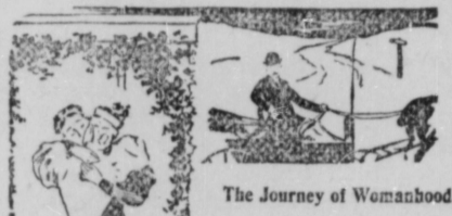
The Journey of Womanhood.

The wildcats and tigers that infest the Mexican wilds flee from the peccaries with instinctive fear, and even rattlesnakes keep out of their path.