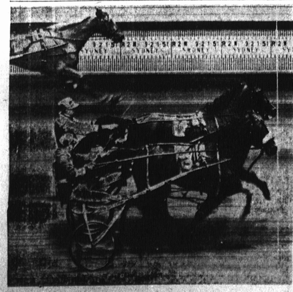
Dead Heat at Sydney Sports Centre

Make Charlottetown Your Racing Headquarters In 1953