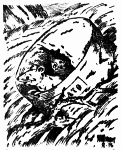
Snowfoot got courage enough to peek out.

There had been a sudden and very heavy shower on this summer's day. For just a little while it seemed as if the clouds must have burst wide open and let all the water they had contained fall, at once. It ran down the hillsides and so into Laughing Brook way back in the Green Forest. In almost no time at all Laughing Brook was roaring instead of laughing. Because the water couldn't run down Laughing Brook to the Big River as fast as it had run into Laughing Brook, the water rose rapidly. And as it did this it picked up many things, sticks and trash of all sorts that had been lying on the ground. Among these things was an old tin can, an old tomato can.